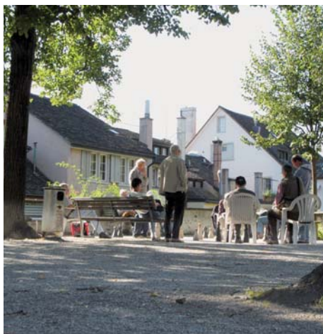
A public game of chess on Lindenhof.

Zurich's old town snuggles up to both banks of the river Limmat, so our old-town stroll does much the same and heads upstream, crossing two bridges and passing a third. We set off at the bridge named after Zurich's first mayor, Rudolf-Brun Brücke , which is easily reached from Bahnhofstrasse or by walking along the Limmat (down Bahnhofquai) from the main train station. At the bridge's south-western corner, just by the Swiss handicrafts shop, head down the steps to the metal walkway leading upstream along the Limmat, almost touching the water (Heiri-Steg). Soon you're on a cobbled street (Schipfe), with some miniature antiques shops and boutiques on the right and the restaurant Schipfe 16, a work project for unemployed and well worth a quick stop, on the left.